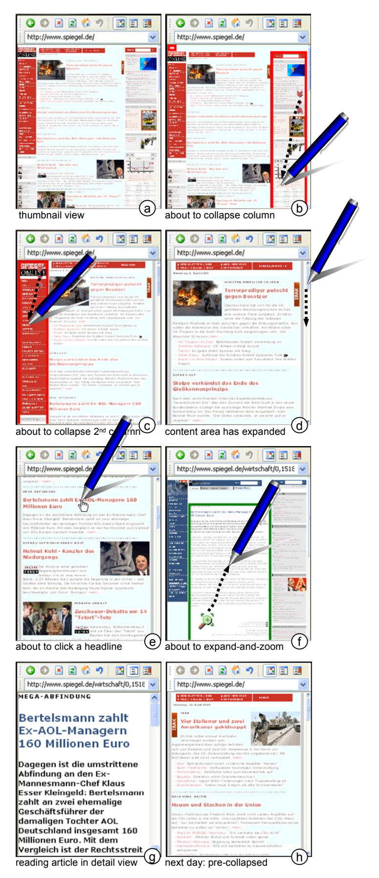
Figure 2: Collapse-to-zoom walkthrough

Figure 2 gives a walkthrough of collapse-to-zoom using the example of the news page from Figure 1. The user's task is to find news articles about the Bertelsmann Company. (a) As the page loads, the browser detects that the page is significantly bigger than the screen and thus shows a