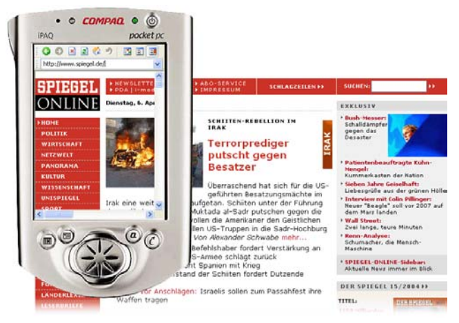
Figure 1: The problem: viewing a page designed for the desktop on a small screen device requires users to scroll not only vertically, but also horizontally.

While single-column views can facilitate the reading process, they result in a correspondingly larger amount of vertical scrolling. In Figure 1, for example, accessing material in the center column now requires users to scroll past the entire content of the left column, as that column will appear at the top of the single-column page. For a typical page, this accounts for several PDA screens worth of material.